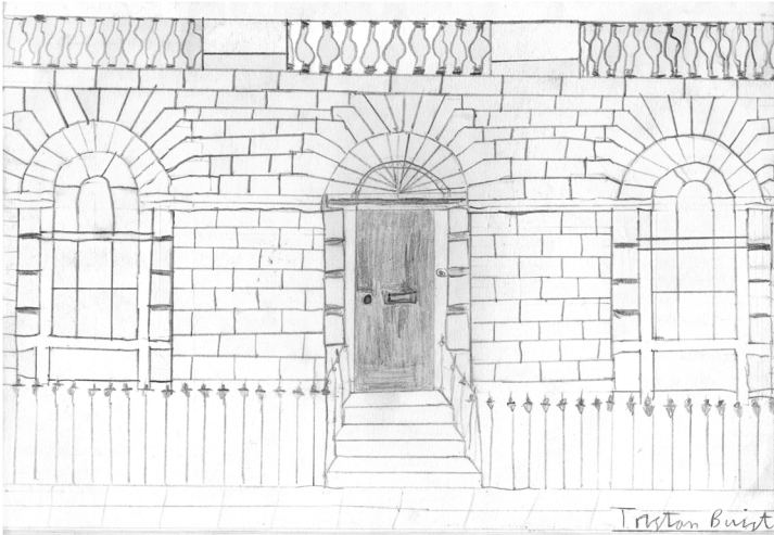
Edinburgh New Town

It was outside Jenner's, on Princes Street where we had been doing a spot of pre-Christmas shopping (not in the toy department, alas) that I had one of my nasty accidents. I was already on first name terms with the staff in A&E at The Western General Hospital – what with the sofa incident and the wash room blood bath, to name but two.