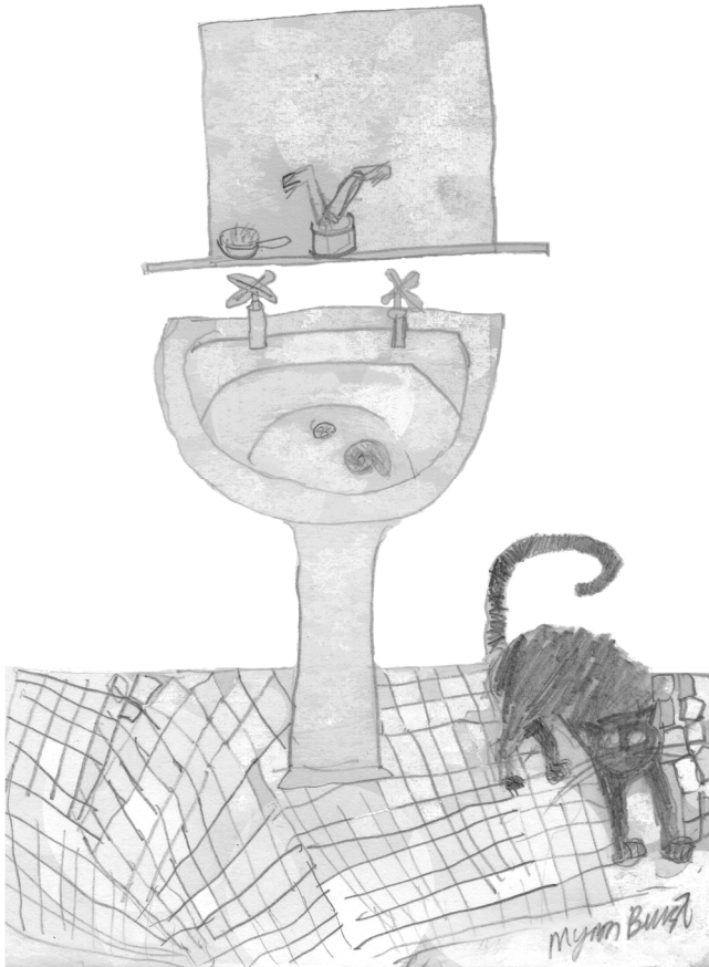
The steaming turd

‘You would have been the same had it been you going to use the wash basin,’ she said darkly, ‘a poo, larger than